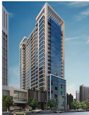
Nottingham - Mechanical and Electrical Consulting Engineers