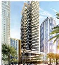
Nottingham - Mechanical and Electrical Consulting Engineers