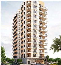
Nottingham - Mechanical and Electrical Consulting Engineers