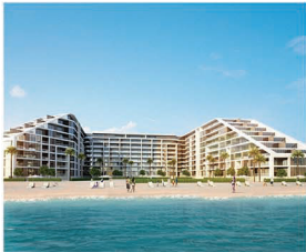
Nottingham - Mechanical and Electrical Consulting Engineers