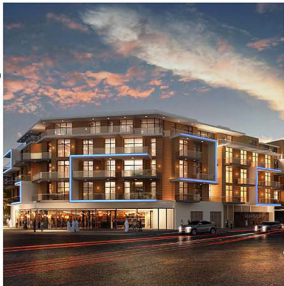
Nottingham - Mechanical and Electrical Consulting Engineers