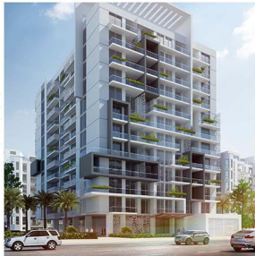
Nottingham - Mechanical and Electrical Consulting Engineers