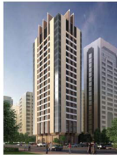
Nottingham - Mechanical and Electrical Consulting Engineers