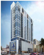
Nottingham - Mechanical and Electrical Consulting Engineers